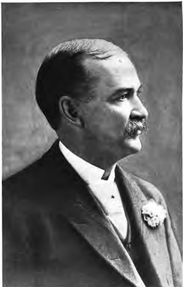
JAMES H. PEABODY